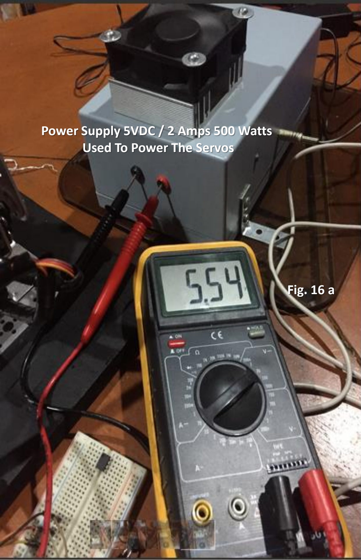
Fig. 16 a

Power Supply 5VDC / 2 Amps 500 Watts Used To Power The Servos